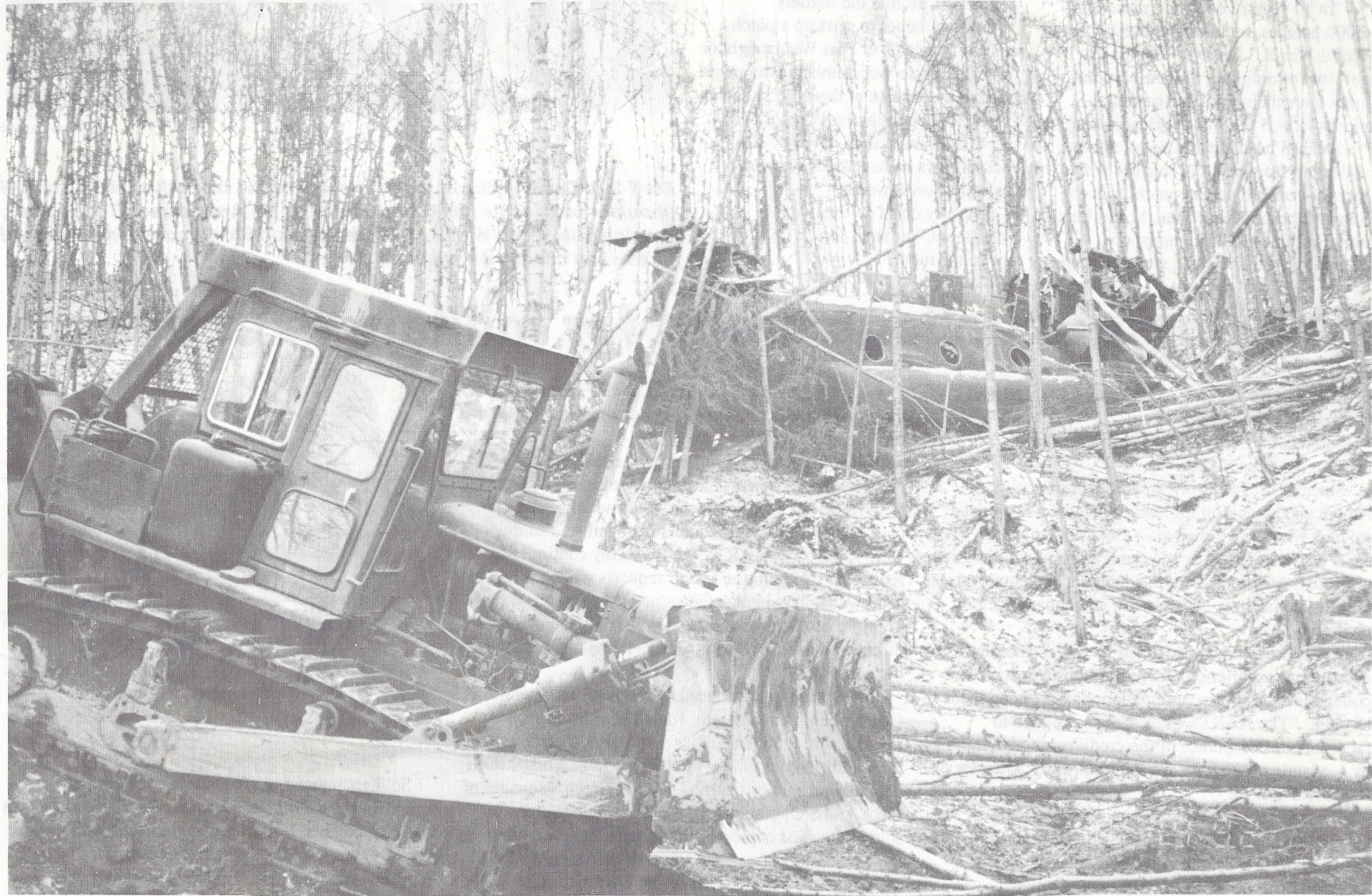
Pfc. Leon Orange uses a D-7G bulldozer to clear the extraction site for the Chinook helicopter.